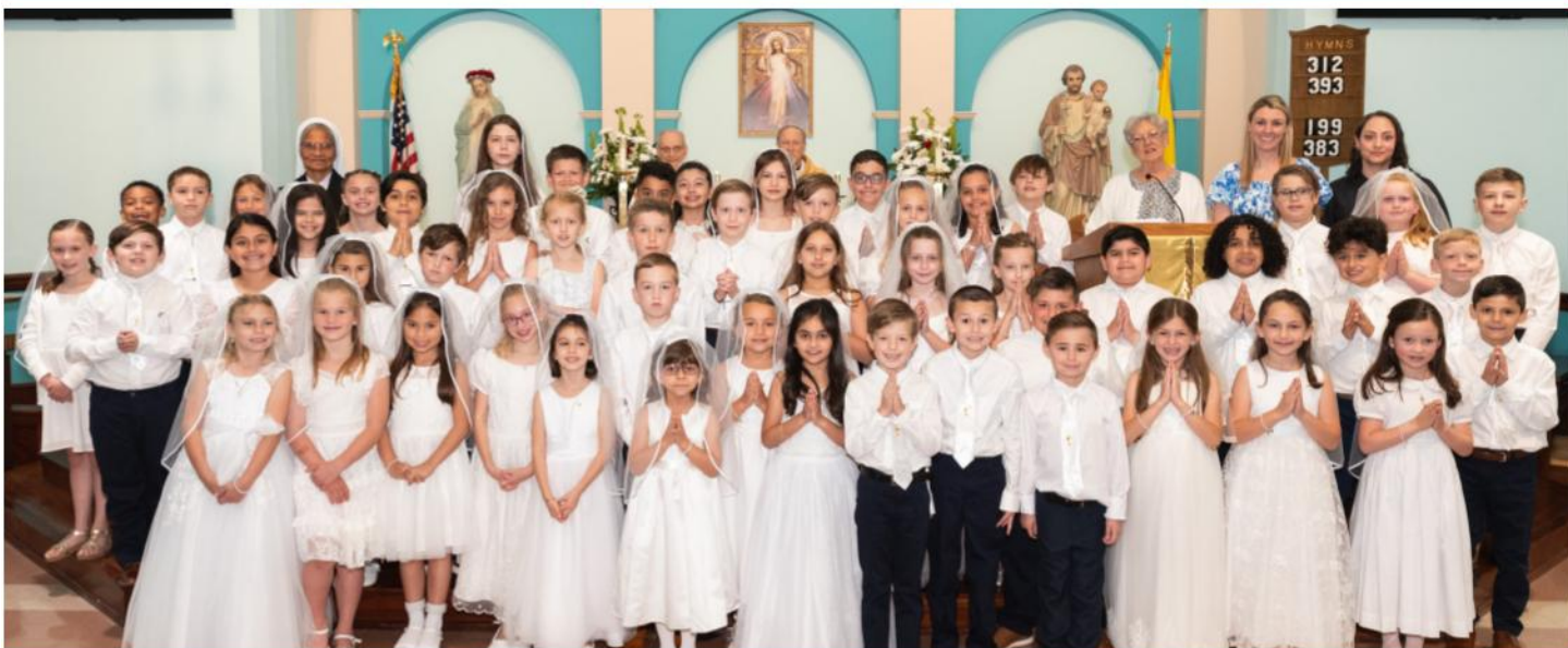
FIRST COMMUNION CLASS OF 2024