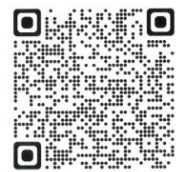
All Saints High School Youth Group Pasta Dinner Fundraiser

https://docs.google.com/forms/d/e/1FAIpQLSf9oroMnREzbFDV6jw5hlyNG5FO78pk34_j1fRwAhtu0FXSA/viewform