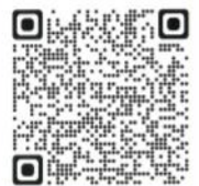
All Saints High School Youth Group Pasta Dinner Fundraiser

https://docs.google.com/forms/d/e/1FAIpQLSf9oroMnREzbFDV6jw5hlyNG5FO78pk34_j1fRwAhtu0FXSA/viewform