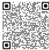
All Saints High School Youth Group Pasta Dinner Fundraiser

https://docs.google.com/forms/d/e/1FAIpQLSf9oroMnREzbFDV6jw5hlyNG5FO78pk34_j1fRwAhtu0FXSA/viewform