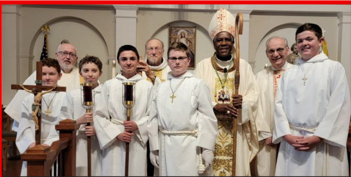
Photos from All Saints confirmation on Sunday, April 30th.

"I will not leave you orphans," Jesus promises his disciples in today's Gospel, emphasizing the importance of the care that a parent gives. On Mother's Day, we honor our mothers and all those who have been like mothers to us: those who have cared for us, who continue to care for us, and who will always care for us, in a similar way to how God always has and always will care for us.