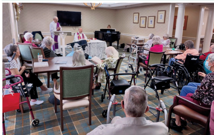
MASS AT ASSISTED LIVING