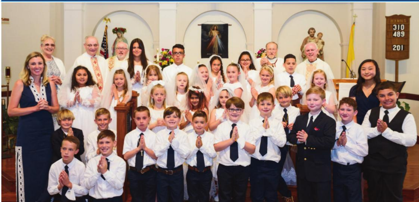
The First Communion class of 2021.