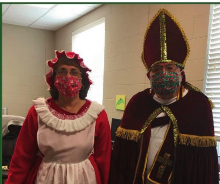
FAITH FORMATION RECEIVES A VISIT FROM ST. NICK!!!

Director of Development & Communications