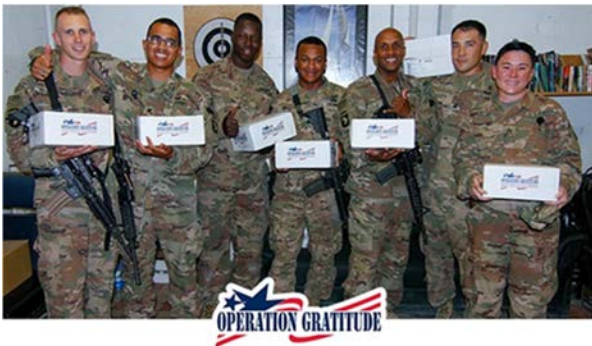
Sponsored by the Saint Michael the Archangel Assembly of the Knights of Columbus

Thank You for all the scarves, hats, and paracord bracelets you crafted for the Handmade with Love drive for Operation Gratitude. Your items will be included in the 75,000 Care Packages being sent to deployed Troops, Veterans, Wounded Heroes and their Caregivers during the Christmas Season and through the end of the year.