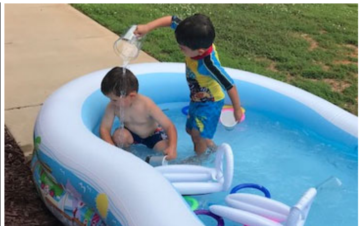
The three year old VBS students practicing baptism after learning about the baptism of Jesus.