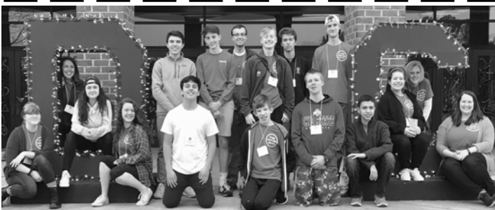
The HS Youth Group at the Diocesan Youth Conference