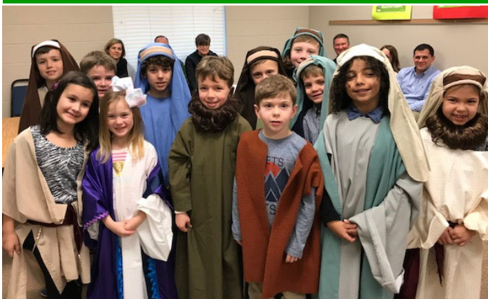
JESUS AND THE TWELVE APOSTLES First Grade Students