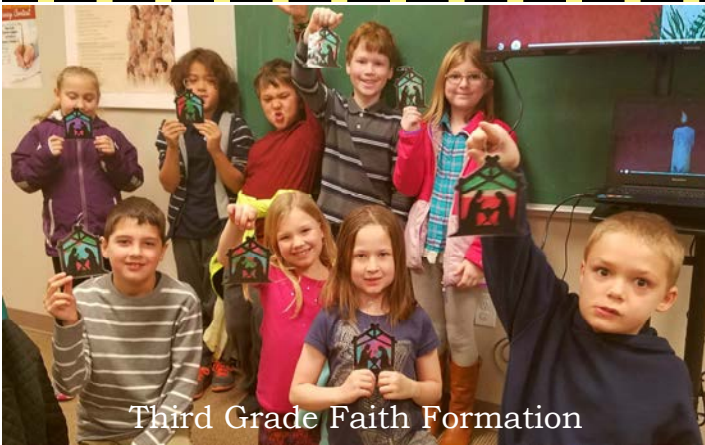
Third Grade Faith Formation