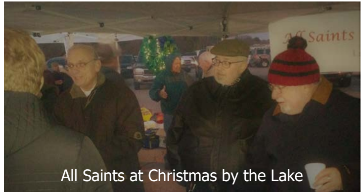
All Saints at Christmas by the Lake