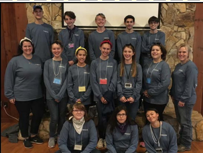
Our students had a great time at the Fall Retreat on November 17-18! Thank you for your prayers and support!