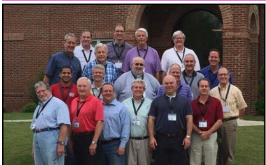
The All Saints men's CRHP participants. “The weekend was exceptional and spiritually rewarding.”