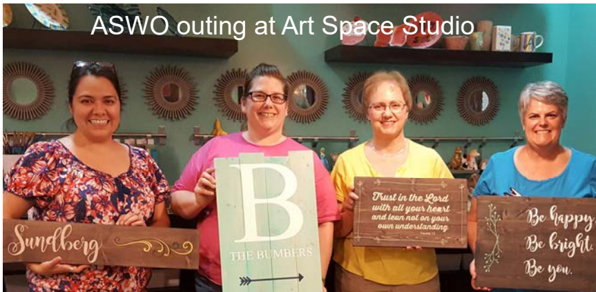
ASWO outing at Art Space Studio

Our Pastor and a team of parishioners is looking toward the future plans of our parish. To receive input from all of our parishioners a postcard with access to our survey was mailed to every home this past week. The survey asks questions about all aspects of parish life so we can plan for the unique needs of our parish. Please take 10 to 15 minutes to prayerfully fill out the survey. We encourage you to participate electronically but paper copies are available in the gathering area after Mass. You can return the paper copy in the offertory collection next week.